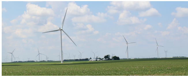
Windfarm in Livingston County