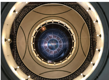
McLean County Museum of History, Bloomington