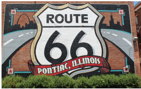
Route 66 Mural, Pontiac