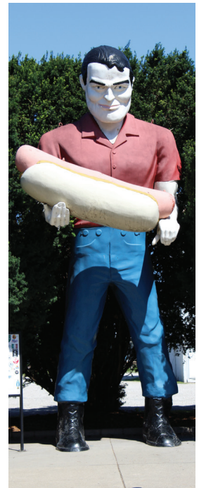
Paul Bunyon Statue, Atlanta