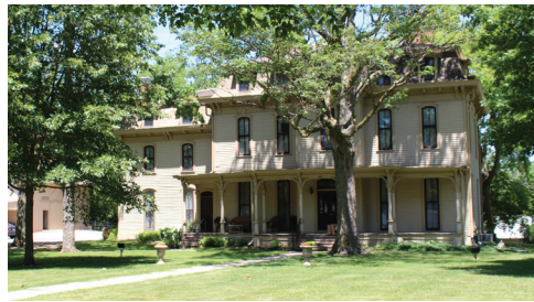
C.H. Moore Homestead DeWitt County Museum, Clinton