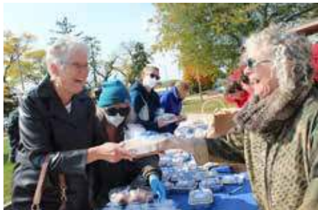
Jewish Life and Culture Fest

Moses Montefiore Temple – $7,000 for “Tech in the Temple”