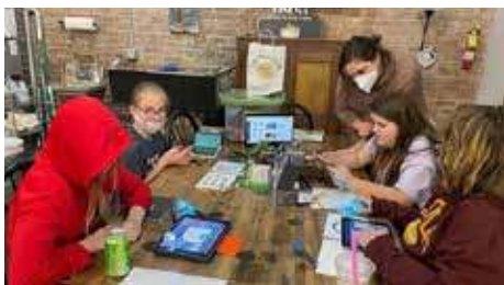
Girl Scouts of Central Illinois

7 Youth Engaged in Philanthropy (YEP) Grants totaling $10,000 were awarded in 2022. They were made possible through the generosity of an anonymous local philanthropist.