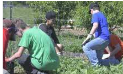
Sunnyside Community Gardens & Food Forest

Ridgeview Elementary School – $1,605 for “Ridgeview Elementary School Sensory Path”