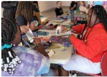
BCAI School of Arts

Holiday Spectacular Inc. – $2,000 for “Free Tickets for Low-Income Community Members 2022”