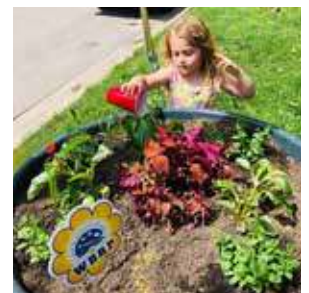
West Bloomington Revitalization Project