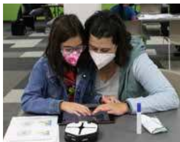
Normal Public Library