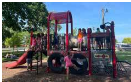
City of Pontiac

YWCA McLean County – $1,300 for “YWCA Young Wonders Youth Development”