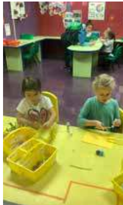
Children’s Discovery Museum & Children’s Home + Aid

YWCA McLean County – $7,072 for “Young Wonders”