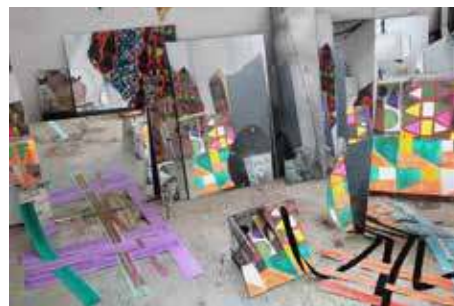
ISU Teen Arts Group at University Galleries

Illinois State University – $4,000 for “ISU String Project”