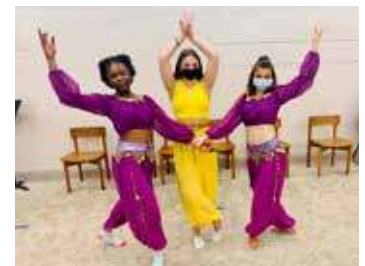
Prairie Fire Theatre

Threshold to Hope Inc. – $1,500 for “Art Instruction and Exploration for Low-Income Artists”