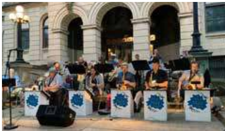
Heartland Jazz Orchestra

Further Jazz – $1,700 for "Jazz Film Series at the Normal Theatre"