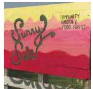
Sunnyside Community Garden & Food Forest

Sunnyside Community Gardens & Food Forest – $930 for "Sunnyside Strawberry Apprenticeship"