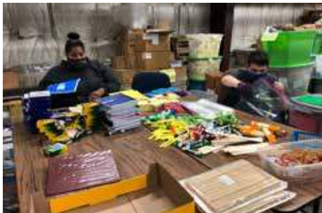
Back to School Alliance

Six Women to Women Grants totaling $40,532 were awarded in 2021 to non-profits collaborating to develop the potential in girls from birth to third grade in our community and their support networks. Funding for the grants comes from generous donors to the Women to Women Giving Circle. Each dollar is allocated as follows: 45% for current grants, 45% for the endowment to provide for future granting capacity, 5% for expenses and 5% for administrative help from IPCF.