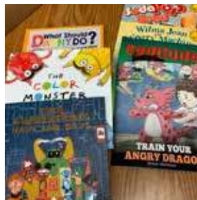
Livingston Co. Commission on Children & Youth

YWCA McLean County in collaboration with Marcfirst – $7,170 for “Young Wonders Learning League”