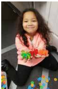
Boys & Girls Club of Bloomington-Normal

Clinton Community Education Foundation – $1,000 for "Read Across Clinton"