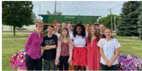
Community Connections Group of Central Illinois

Community Connection Group of Central Illinois – $1,200 for "Building Future Leaders and Entrepreneurs"