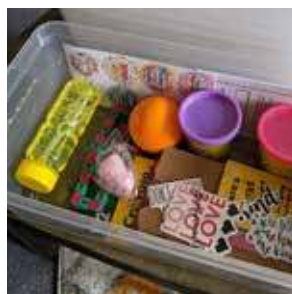
McLean County Children's Advocacy Center

Illinois Art Station – $1,200 for "smARTS Lab"