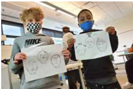
BCAI School of Arts

Back to School Alliance – $1,000 for "Getting Ready for Pre-School"