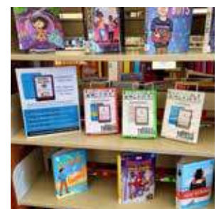
Vespasian Warner Public Library

West Bloomington Revitalization Project – $1,175 for "Seeds for Change"