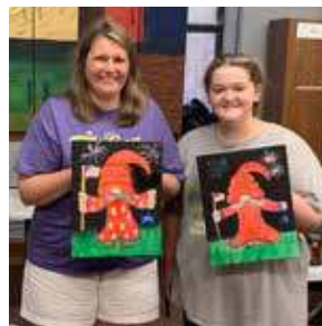
Inside Out Accessible Art

Inside Out Accessible Art Cooperative – $2,500 for "Art Education"