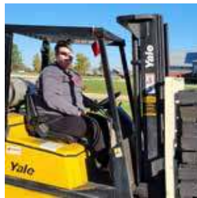
Dreams Are Possible

Dreams Are Possible – $3,500 for "Expanding Your Opportunities"