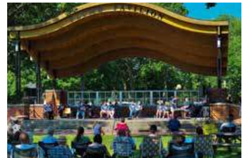
Poco A Poco

Music Connections Foundation's "Niños y Música" – $4,000